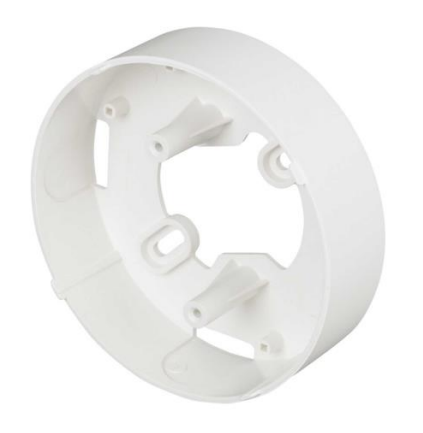
PVC MK BOX FOR DEVICE BASE