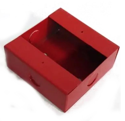
MS BOX FOR SOUNDER