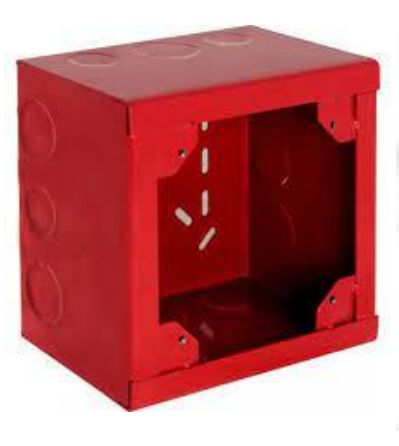
MS BOX FOR MODULES